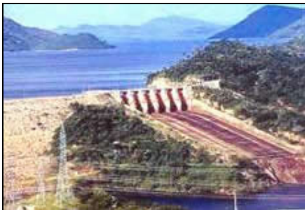
The Volta Dam in Ghana

These developments have not come without cost however. The Volta dam has led to a reduction in the shrimp population – an important source of protein for people living in the area. This reduction is because less food is being brought down the river for the shrimps. A fall in protein affects the health and nutrition standards of a population.