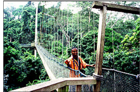
The canopy walkway in Kakum National Park, Ghana

The number of visitors increased from 20,000 in 1995 to 59,000 in 1998, while revenue from the walkway rose from $10,000 to $108,000. Much of this money goes to the Ghana Heritage Conservation Trust, a local non-governmental organisation that uses the funds to maintain the walkway and fund conservation and sustainable development projects with local communities.