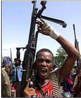
Rebel soldier in Sierra Leone

Their unusual behaviour made grandma and grandpa suspicious and very worried for our safety. They decided to leave the house the following morning and take cover at a doctor's house. Later that day the rebels returned to my grandparent's house to ask for grandma. When they did not find her there they took all the valuables and set the house on fire. It was so dreadful for us all, especially grandma.