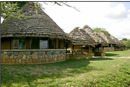
Typical African safari lodge

According to 1998 figures from the World Tourism Organisation, Africa was the fastest-growing region for international tourism, with 25 million tourists visiting African countries and this figure growing by 7.5% a year. South Africa, Zambia, Zimbabwe and Madagascar were the leading countries, particularly for ecotourism.