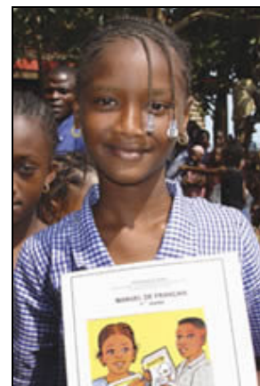
Small scale investment can help children go to school