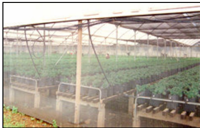
Most flowers in Kenya are grown in large greenhouses

"It is always like this just before Valentine Day", says the 32 year-old, even though the popular "Lovers Day" is not celebrated in rural Kenya in the way it is in the USA and Europe. The farm Irene works on earns 20% of its year's income in the ten days running up to Valentines Day.