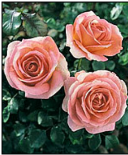
Kenya is the world's leading exporter of roses

Kenya's flower industry is the oldest and largest in Africa. The industry has grown to become the biggest exporter of roses and carnation flowers in the world. In 2003 sales of flowers was worth £77million, which was 8% of Kenya's export earnings.