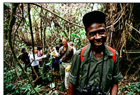
The Bwindi Forest in Uganda provides jobs for the local community

Hundreds of people work as rangers and camping staff or provide food, crafts and entertainment for foreign tourists who come to trek in the forest and view gorillas. In the Buhoma valley just outside the park, many local businesses have started up, offering goods and services to visitors. This 'multiplier effect' brought about by tourism can have considerable benefits to the local economy. It is estimated that for every hotel room established for tourists, up to two jobs are created.