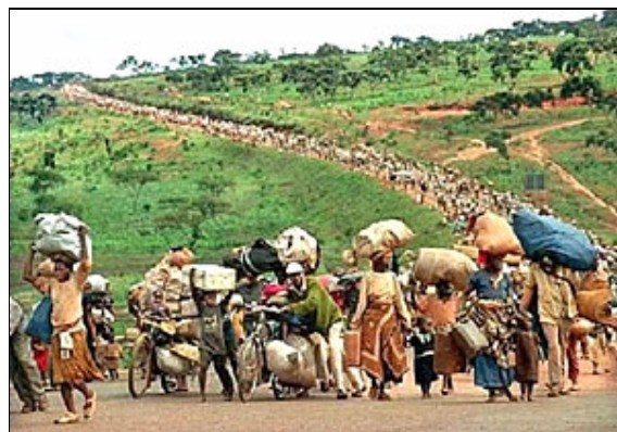
Tens of thousands of people have fled their homes because of conflict in DRC