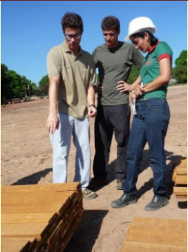
Picture: TTAP Brazil team in action

One year after the launch of TTAP in Latin America, steady progress has been made in Brazil which has helped to consolidate the project in the region. In the last eight months the TTAP team has assessed approximately 130.000 hectares of forests divided into 5 concessions, and 10 factories linked to these concessions to see if they are ready to get legality verification. Most of these concessions and factories are close to full compliance with the Brazilian legality standards.