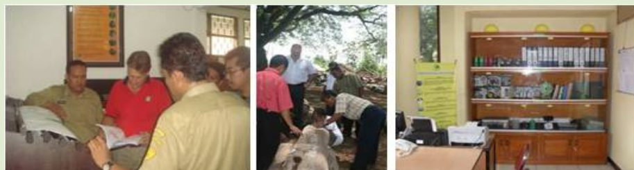
Assessments in Randublatung and Kebonharjo, the Banten office