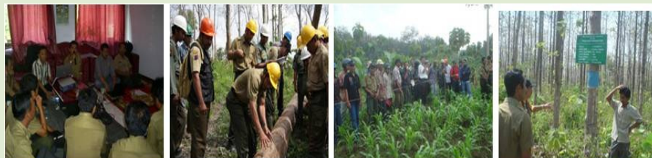
Classroom and field training session at Perhutani