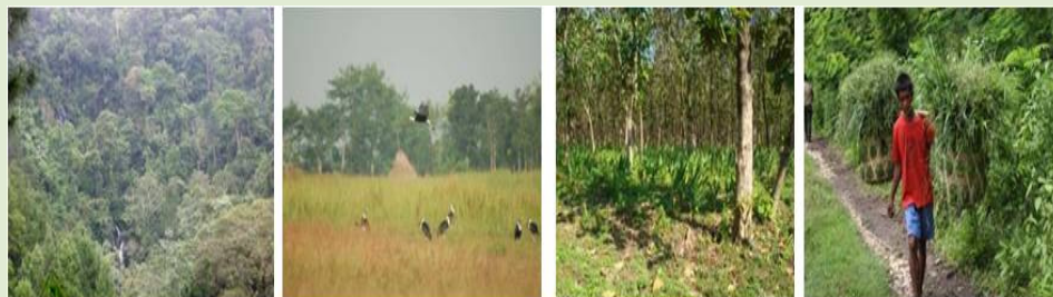
HCVF in Ciamis, wildlife in Randublatung, curcuma cultivation and feed for livestock is gathered by the local population